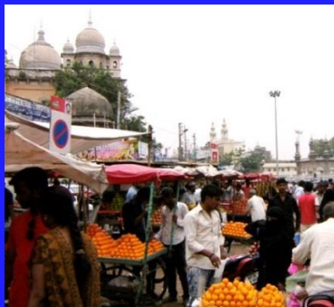
Hyderabad City Market

The 2013 Congress will be held under the Patronage of His Excellency Mr N. Kiran Kumar Reddy, the Chief Minister of Andhra Pradesh, India